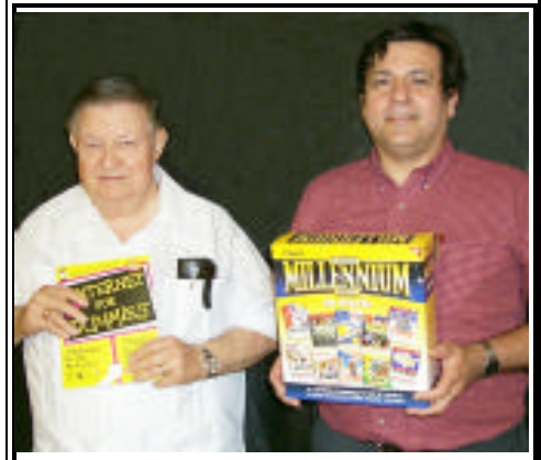
July Door Prize Winners

Recommended minimum system requirements are 300MHz processor, 128 MB memory, 1.5 GB of available hard disk space, Super VGA (800X 600) video adapter and monitor, CD-ROM or DVD drive, keyboard, and Microsoft Mouse or compatible pointing device.