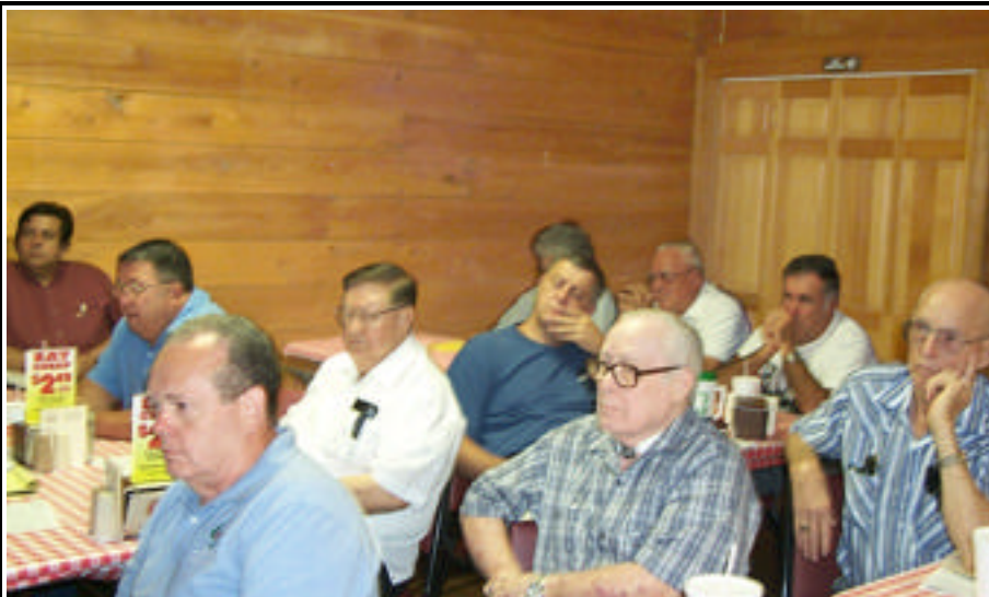
C-B WUG Members Watch Program on Windows XP